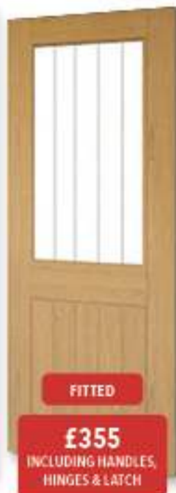
1/2 GLASS ELY