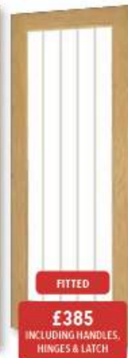
FULL GLASS ELY