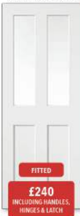
SMOOTH ASHFORD 4 PANEL GLASS DOOR